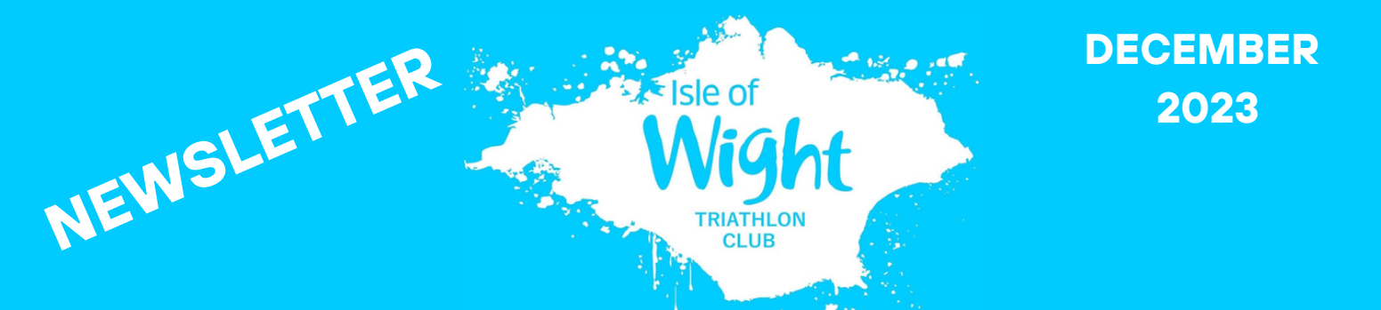
Dear all members and families,

I hope this message finds you all in high spirits as we approach the festive season and look back at a great year the club has had. Firstly, I want to express my gratitude for your vote of confidence in entrusting me with this role and I'm genuinely excited to work with you and the committee to keep building on what is already a successful and fun club. I have a long history with triathlon and hope to bring the passion that I have for the sport to all our members.